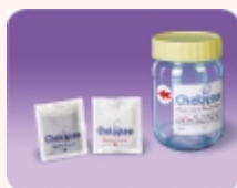
1. Media pouches & sterile bottle