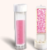
TBC + Yeasts & Fungi