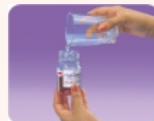
4. Water upto the red arrow mark