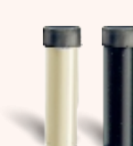
SRB - Sulphate Reducing Bacteria