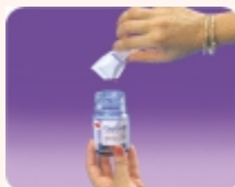
3. Pour the contents of both pouches into the bottle