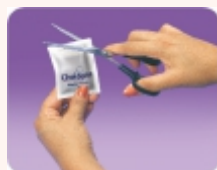
2. Cut open both the pouches carefully