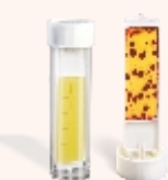
Total Bacterial Count