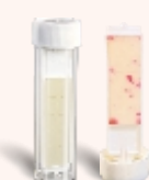
TBC + Pseudomonas