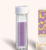
TBC + E.coli