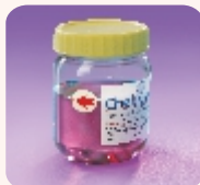
6. Then observe the colour of liquid in bottle

If the Colour is Violet Water Is Potable